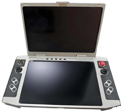
Handheld Remote Controller (Ground Terminal) Prototype, the actual delivery shall prevail