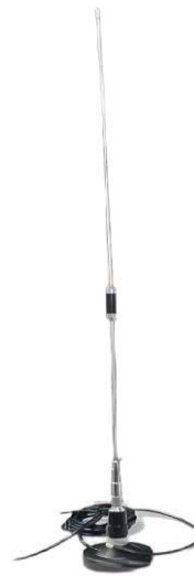
96cm Customized RF Antenna